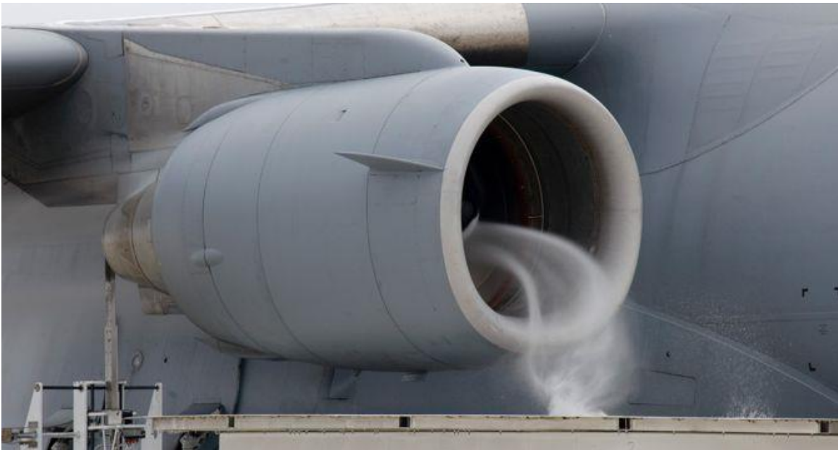
Fig. 1. A photo that shows how a non-uniform flow is going into the aircraft engine air intake device

In the case of any substance flow, including two-phase flow, the mass or volume of substance per unit time per tube, or flow rate - Q_m or Q_v , depends on flow parameters such as mixture composition and heterogeneity, component phase velocities (usually different from each other). ) Structure and concentration of substances in each phase, etc. Often the concentration of a single phase of the mixture varies along the length of the tube, so instantaneous flow measurements will never be relevant to the actual flow. In this case, the average value of the flow in a defined time interval is used to characterize two-phase flow. The average velocities of the heavy phase (in our case solid particles) are usually less than the velocities of the light phase.